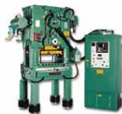
TYPICAL PUNCH PRESS

The inhalation of beryllium-containing dust, mist or fume can cause a serious lung condition in some individuals. The degree of hazard varies depending on the form of the product and how the material is processed and handled. You must read the product specific Safety Data Sheet (SDS) for additional environmental, health and safety information before working with any beryllium-containing alloys.