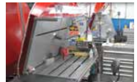
LEV GRINDING HOOD

Local exhaust ventilation (LEV) is required when coolants or lubricants are not being used or are not effective in controlling the release of airborne particulate and where there is potential for worker exposure. Where utilized, exhaust inlets to the ventilation system are generally positioned as close as possible to the source of generated airborne particulate. The type and capacity of the LEV will depend on the speed of the particle generation. Some operations (hand grinding, roto tools) are difficult to control due to the random nature of the particle generation. These operations should be conducted in a ventilated enclosure designed to contain all particulate within the enclosure and away from the operator's breathing zone.