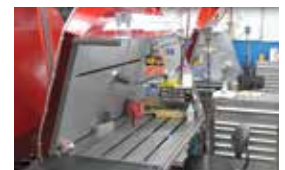
LEV GRINDING HOOD

Local exhaust ventilation (LEV) is required when coolants or lubricants are not being used or are not effective in controlling the release of airborne particulate and where there is potential for worker exposure. Where utilized, exhaust inlets to the ventilation system are generally positioned as close as possible to the source of generated airborne particulate. The type and capacity of the LEV will depend on the speed of the particle generation. Some operations (hand grinding, roto tools) are difficult to control due to the random nature of the particle generation. These operations should be conducted in a ventilated enclosure designed to contain all particulate within the enclosure and away from the operator's breathing zone.