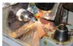
HIGH SPEED SURFACE GRINDING

The proper use of machining fluids is usually an effective method for reducing the airborne generation of beryllium containing particles. The machining fluids are used to lubricate and cool the cut and to flush away the resulting swarf.