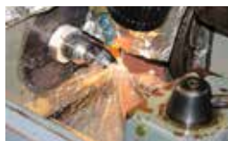
HIGH SPEED SURFACE GRINDING

The proper use of machining fluids is usually an effective method for reducing the airborne generation of beryllium containing particles. The machining fluids are used to lubricate and cool the cut and to flush away the resulting swarf.