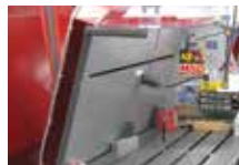
LOCAL EXHAUST VENTILATION GRINDING HOOD

The use of engineering and/or work practice controls are the preferred methods of controlling exposure to beryllium-containing particulate.