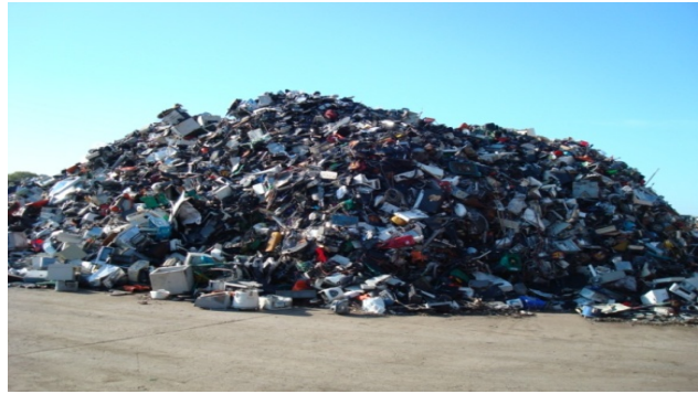
Picture showing incoming WEEE

The non-metallic materials that are dropped by the ECS ("ECS Drops") are conveyed through another picking shed (9) where employees remove rubbish, batteries and metal containing objects. The ECS Drops are bunkered before further processing by additional shredding, after which they are treated to separate metallic and nonmetallic materials by density (10). The residual plastic streams are bunkered and further treated (11) to segregate these materials into individual plastic streams and sold for recycling. Nonrecoverable materials such as rubbish, paper and cardboard removed during manual separation operations are sent to landfill for disposal.